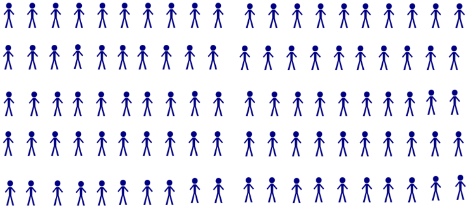
Higher Professionals (100%)

In a typical Leaving Cert Class, the children of Higher Professionals are significantly more likely to go to college than other socio economic groups.